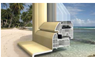
window profile wrapping